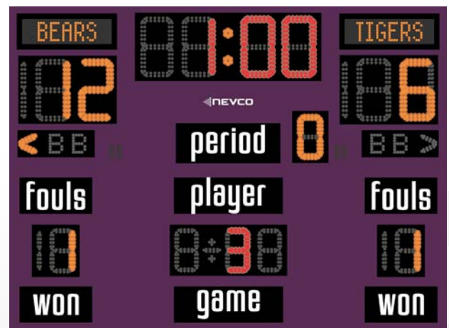
OPTIONAL ELECTRONIC TEAM NAMES AVAILABLE