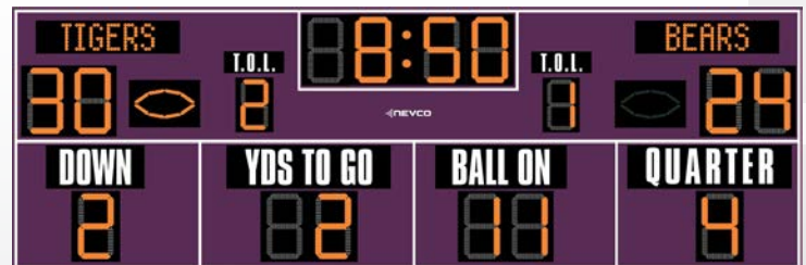
SHOWN WITH OPTIONAL ELECTRONIC TEAM NAMES