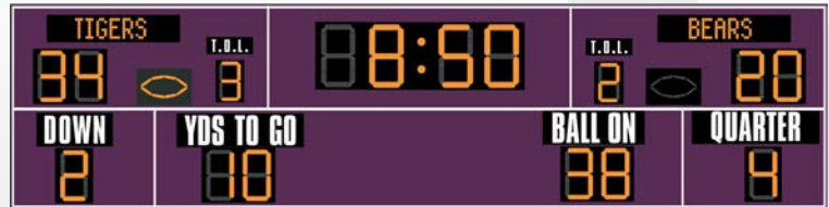
SHOWN WITH OPTIONAL ELECTRONIC TEAM NAMES