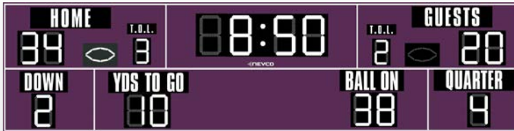
SHOWN WITH OPTIONAL WHITE LEDS