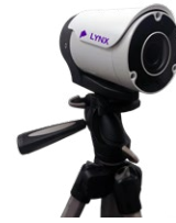
IdentiLynx Full-Frame Video Camera