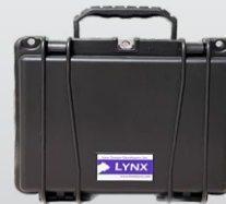
Custom Storage/ Carrying Case