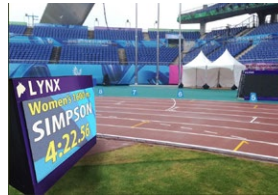
6.9'W x 4.8'H 5mm Infield Video Display