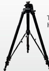
Tripod and Mounting Hardware