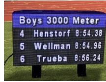
3.2'W x 1.6'H 5mm Portable LED Display