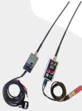
RadioLynx Wireless Start System

Enhance your silver package with upgraded features and functions!