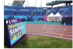
6.9"W x 4.8"H 5mm Infield Video Display