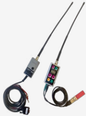
RadioLynx Wireless Start System

Note: In order to take advantage of these upgrades, a camera upgrade is needed and can be completed by mailing it in.