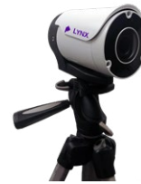
IdentiLynx Full-Frame Video Camera