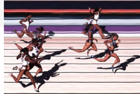
Auto-Capture Mode (ACM) Plug-In