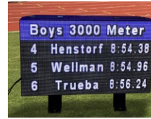
3.2"W x 1.6"H 5mm Portable LED Display