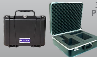
Custom Storage/Carrying Case