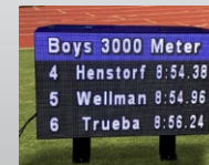
3.2'W x 1.6'H 5mm Portable LED Display