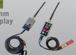
RadioLynx Wireless Start