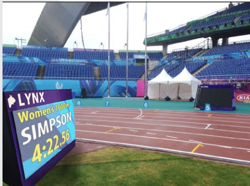
6.9'W x 4.8'H 5mm Infield Video Display

Enhance your platinum package with upgraded features and functions!