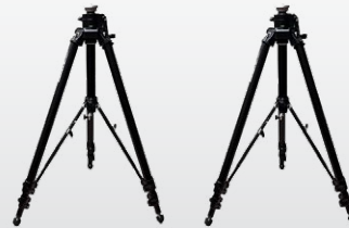
Tripod and Mounting Hardware(x2)