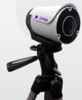
IdentifyLynx Full-Frame Video Camera