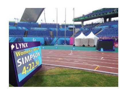
6.9'W x 4.8'H 5mm Infield Video Display