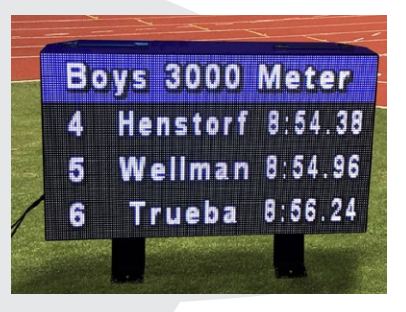
3.2'W x 1.6'H 5mm Portable LED Display

Enhance your gold package with upgraded features and functions!