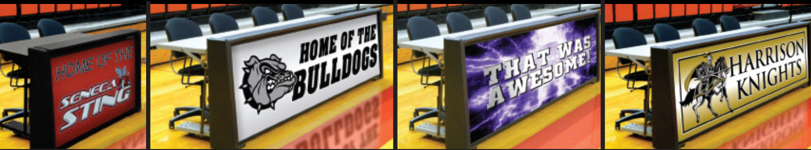
Table Sizes: 4ft, 8ft and 10ft