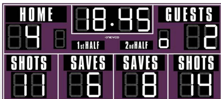
SHOWN WITH OPTIONAL WHITE LEDs