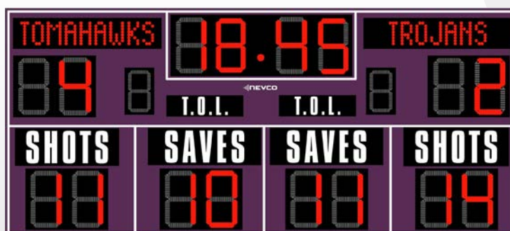
SHOWN WITH OPTIONAL ELECTRONIC TEAM NAMES