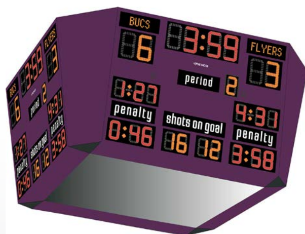
OPTIONAL ELECTRONIC TEAM NAMES AVAILABLE