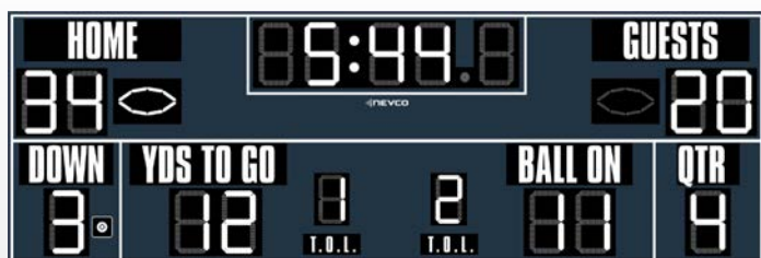
SHOWN WITH OPTIONAL WHITE LEDS