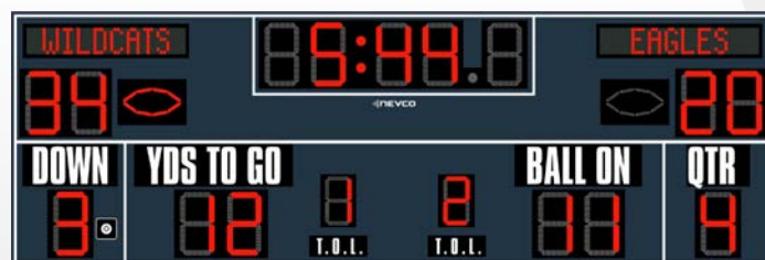
SHOWN WITH OPTIONAL ELECTRONIC TEAM NAMES

Advanced timing features ideal for combination Football, Baseball, Softball, Soccer, Lacrosse, Field Hockey and Track facilities.