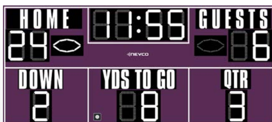
SHOWN WITH OPTIONAL WHITE LEDS